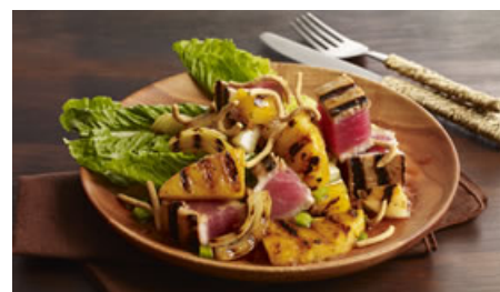
Hawaiian Grilled Tuna & Pineapple 'Poke'

SPARKS, Md., May 4, 2017 – It's time to up your grilling game! Today, McCormick & Company, Incorporated (NYSE: MKC), a global leader in flavor, released its annual McCormick Flavor Forecast 2017: GRILLING EDITION . This grilling-centric report features five sizzling flavors and red-hot techniques that will take your backyard cooking to the next level – from seared Hawaiian poke to tangy white BBQ sauce and sticky sweet wings with bold black pepper.