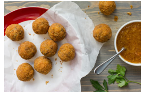
Dirty Rice Boudin Balls